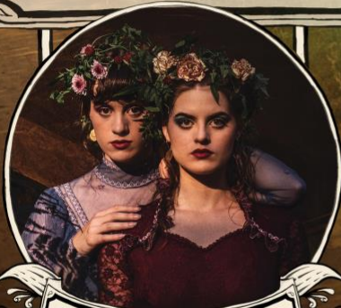
CHARM OF FINCHES (AUS)

WED 30 MAR BOOLAKRA, BOOLAKRA MEMORIAL HALL, VIC THU 31 MAR HEYFIELD, HEYFIELD MEMORIAL HALL, VIC FRI 1 APR LOCH SPORT, LOCH SPORT PUBLIC HALL, VIC SAT 2 APR PORT ALBERT, PORT ALBERT MECHANICS HALL, VIC SUN 3 APR QUEENSCLIFF, QUEENSCLIFF TOWN HALL, VIC WED 6 APR GLENLYON, GLENLYON SHIRE HALL, VIC THU 7 APR MERTON, MERTON MEMORIAL HALL, VIC FRI 8 APR STANLEY, STANLEY SOLDIERS MEMORIAL HALL, VIC SAT 9 APR BARNAWARtha, BARNAWARThA SOLDIERS MEMORIAL HALL, VIC SUN 10 APR SEDGWICK, SEDGWICK PUBLIC HALL, VIC WED 13 APR RAND, RAND SCHOOL OF ARTS, NSW 14 - 17 APR NATIONAL FOLK FESTIVAL, ACT